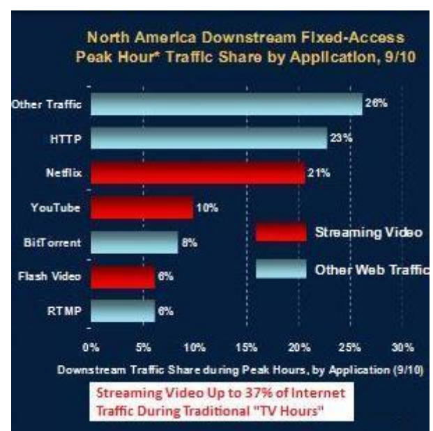
Source: Sandvine Fall 2010 Global Internet Phenomena Report, Morgan Stanley Research.

Notes: *Peak hours are the periods during which bandwidth utilization is heaviest. They typically occur in the evening and last 3-5 hours. (e.g., peak hours for Netflix= 8-10pm). RTMP stands for real-time messaging protocol (Instant messaging).